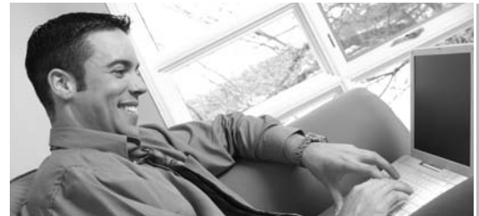
Someone like Peter is looking for a plan where he doesn't have to pay for benefits he may not use. He would still like coverage should he be in an accident or is affected by a medical condition. Peter may find the benefits with Personal Benefit (HDHP) a good fit for his health insurance needs.