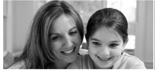
Someone like Amber wants a health insurance plan that provides her family a wider range of benefits. She may prefer the lower deductibles and lower out-of-pocket costs of Personal Select.