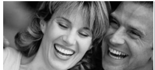
People like Mary and Carl live a healthy lifestyle and like greater control of their medical expenses. They may prefer a plan with an SDA where the funds can be used to pay for preventive services. A good choice is Personal SDHP.